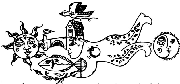
kensington festival of lights

The 16th Annual Kensington Festival of Lights - December 21, 2004